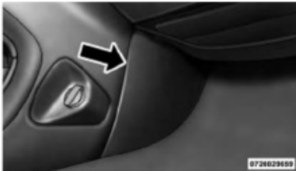
Console Closeout Panel